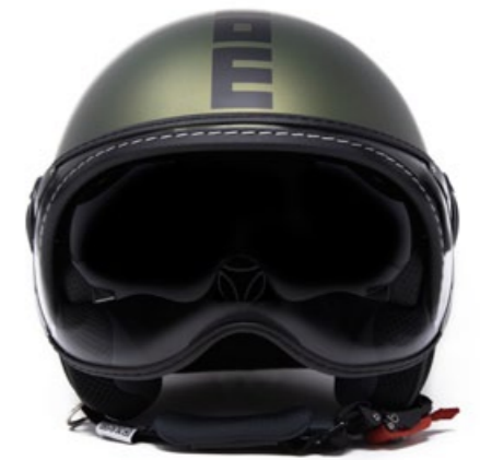
EVO MILIT. GREEN MET - BLACK DECAL 1001003048