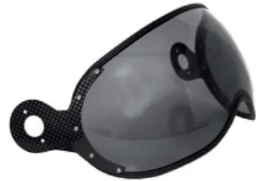
STANDARD DARK VISOR 80% SCRATCH RESISTANT