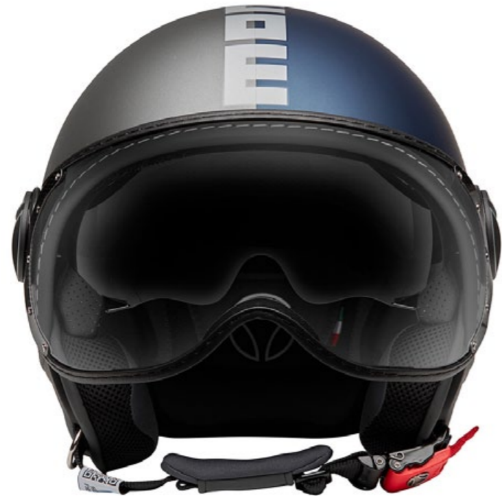
EVO JOKER BLUE/ CLEAR GREY - SILVER DECAL 1001007001