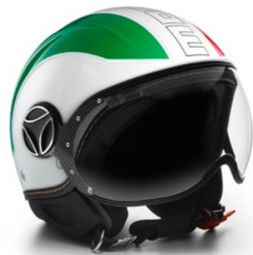
GREEN - WHITE - RED 150° - BLACK OUTLINE DECAL 1003008001 PRICE: €279,00