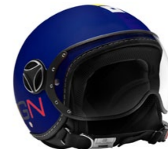
BLU MATT/MLTC 1023000000