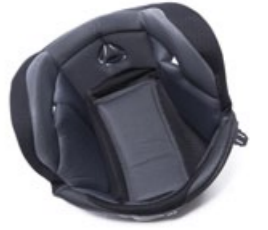
BLADE PADDING SIZE BLADE XXS-XL