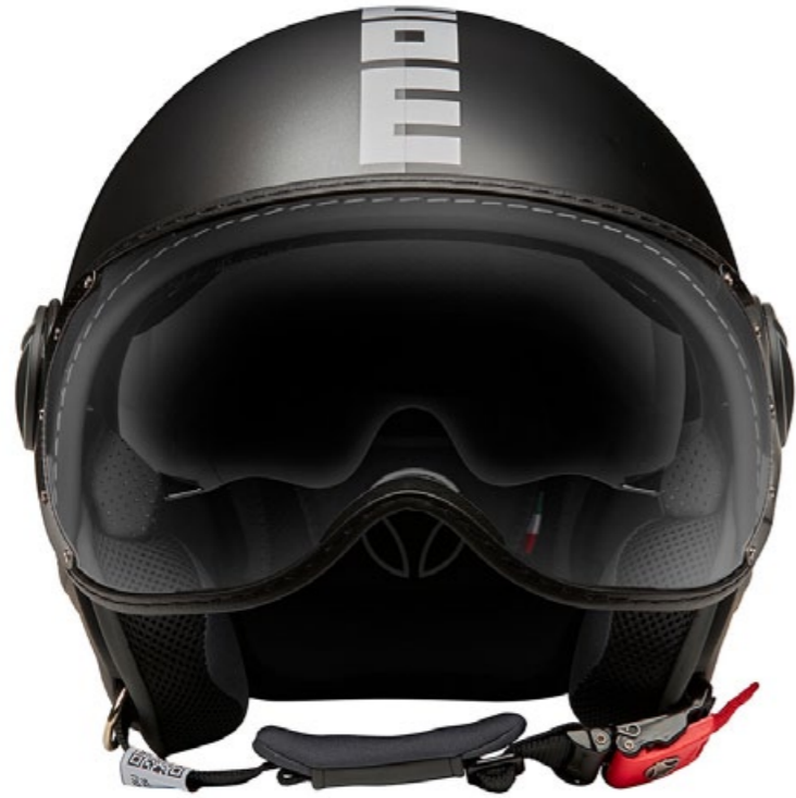
EVO JOKER BLACK/ DARK GREY - SILVER DECAL 1001007000

This edition revises the iconic shell with two colours that gives a twin and unique personality and a sophisticated look. ABS demi jet shell in two sizes. Removable and washable inner padding with high sweat absorption fabric and mesh fabric net with silver ion treatment for an effective bacteria-static action. Removable and washable cheek pads; Brushed metal screw; Anti-scratch visor UV400 with carbon fiber support; Dark sun visor; Chinstrap with micrometric buckle.