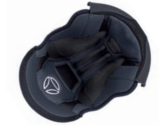
INNER PADDING SIZE EVO/AVIO XXS-XL