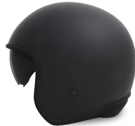
MONO BLACK MATT - SILVER 1014052001