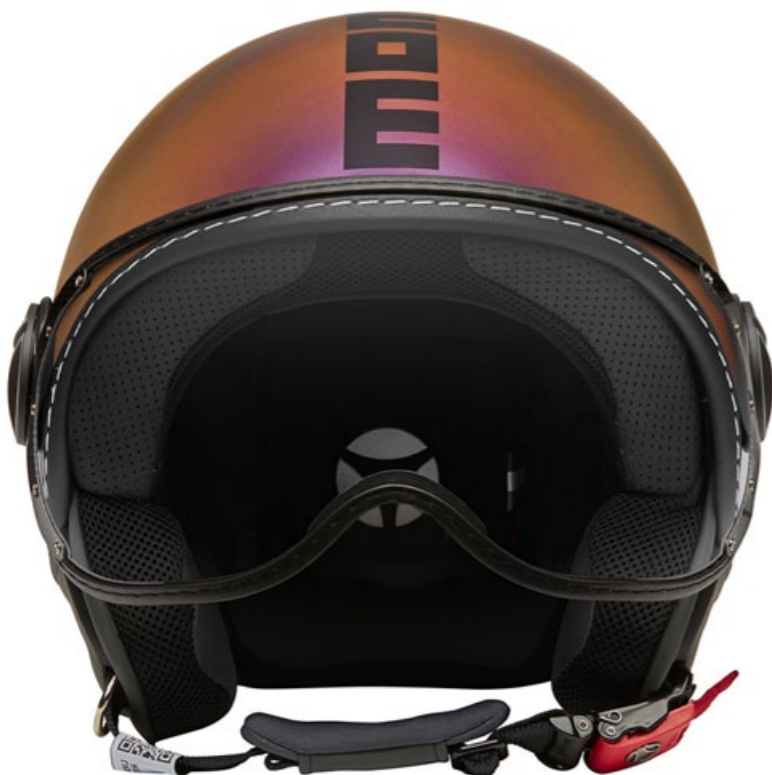
FUCSIA GLOSSY COPPER - BLACK DECAL 1001002041

PRICE: €209,00 small shell - XXS 54cm - XS 55cm S 56cm - M 57cm large shell - ML 58-59cm - L 60cm XL 61cm