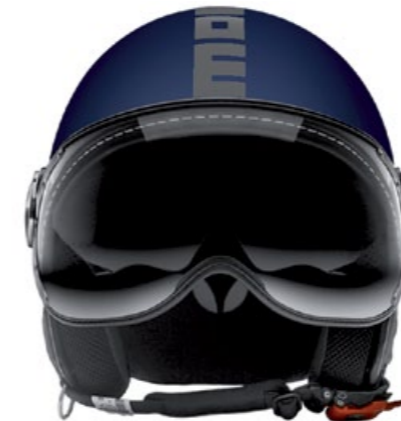
EVO BLUE MATT - SILVER DECAL 1001003038