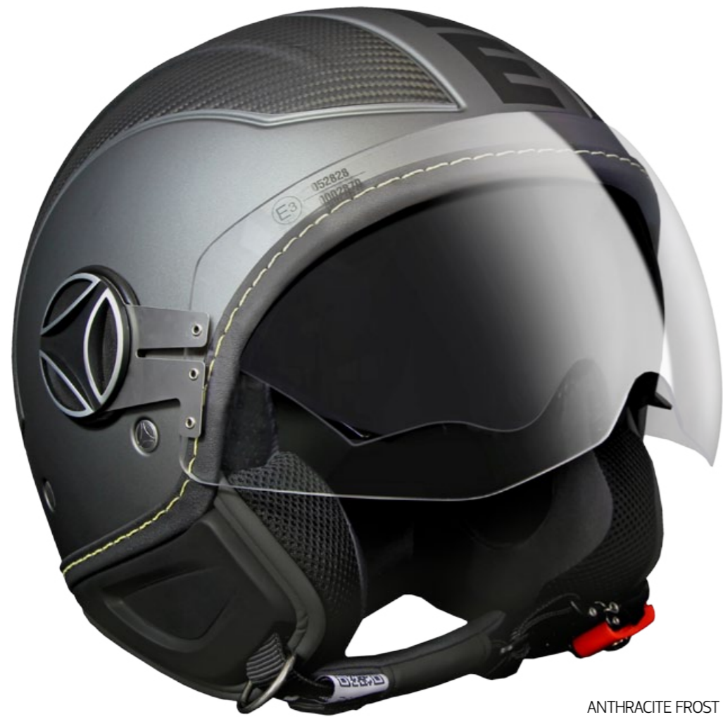
ANTHRACITE FROST CARBON - BLACK DECAL 1003009001 PRICE: €309,00

AVIO is an aeronautical inspired demi jet helmet totally made out of composite material to guarantee higher safety standards and lightness. Equipped with a medium visor with a steel visor support to optimize the performance and to emphasize the dynamic and sportive style of the particular shell design. Fiberglass and carbon monocoque shell in two sizes. Removable and washable inner padding with high sweat absorption fabric and mesh fabric net with silver ion treatment for an effective bacteria-static action. Removable and washable cheek pads. Chinstrap with micrometric buckle. Brushed metal screw. Anti-scratch visor UV400 with new steel support. Dark sun visor.