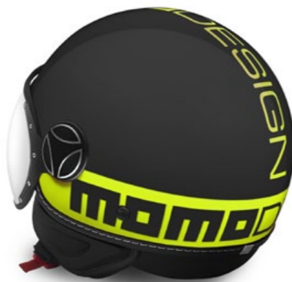
BLACK MATT - YELLOW FLUO DECAL 1001004030