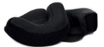
CHEEK PADS CLS BLACK XXS-XL