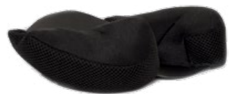
MINIMOMO CHEEK PADS