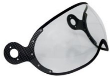
STANDARD CLEAR VISOR SCRATCH RESISTANT