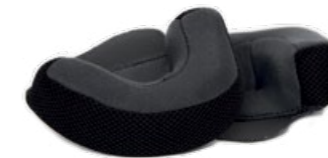
CHEEK PADS (PAIR) EVO ANTHRACITE XXS-XL