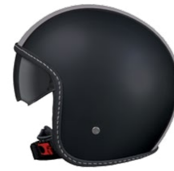
long-jet with sun visor ABS