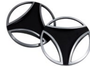
VISOR SCREW LOGO EVO