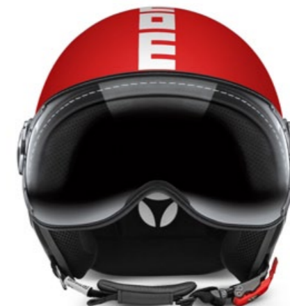
CLS RED MATT - WHITE DECAL 1001002024