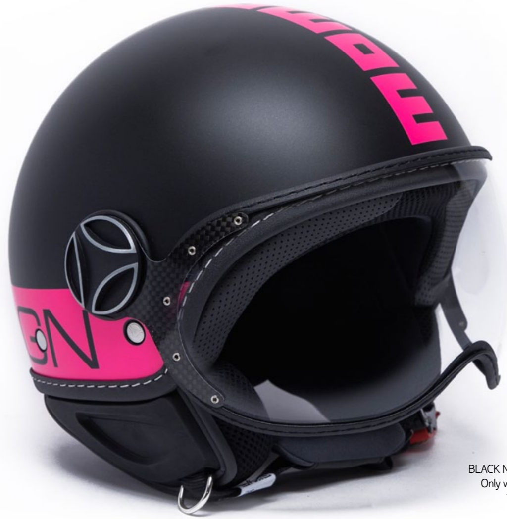
BLACK MATT - FUXIA DECAL Only women size XXS-M 1001004029

FLUO is the version presented with FLUORESCENT DECALS colours in order to increase visibility on the roads. Inner padding with high sweat absorption fabric and mesh fabric net with silver ion treatment for an effective bacteria-static action. ABS demi jet shell in two sizes. Brushed metal screw. Anti-scratch visor UV400 with carbon fiber support. Chinstrap with micrometric buckle