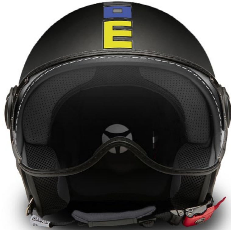
CLS BLACK MATT - MLTC DECAL 1001002045

Inspired by the timeless design of the first FGTR helmet, the multi-coloured logo expresses metropolitan trends. The bright tones of the city lights by night, a new aesthetic that draws inspiration from city trends, satisfying the youngest urban riders. Inner padding with high sweat absorption fabric and mesh fabric net with silver ion treatment for an effective bacteria-static action. Brushed metal screw. Anti scratch visor UV 400 with carbon fiber support ABS demi jet shell in two sizes