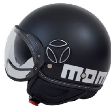
demi-jet with mid visor ABS