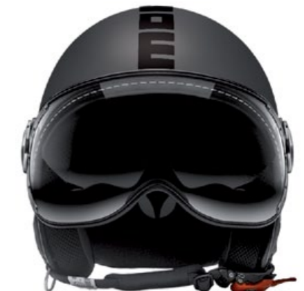
EVO TITANIUM FROST - BLACK DECAL 1001003029