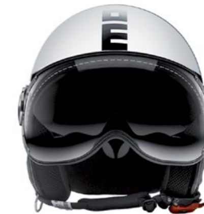
EVO WHITE QUARTZ GLOSSY - BLACK DECAL 1001003008