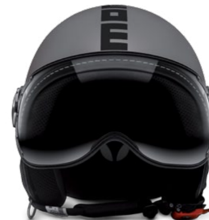
CLS GREY MATT - SILVER BLACK 1001002036