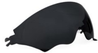
NEW SUN VISOR 80% DARK