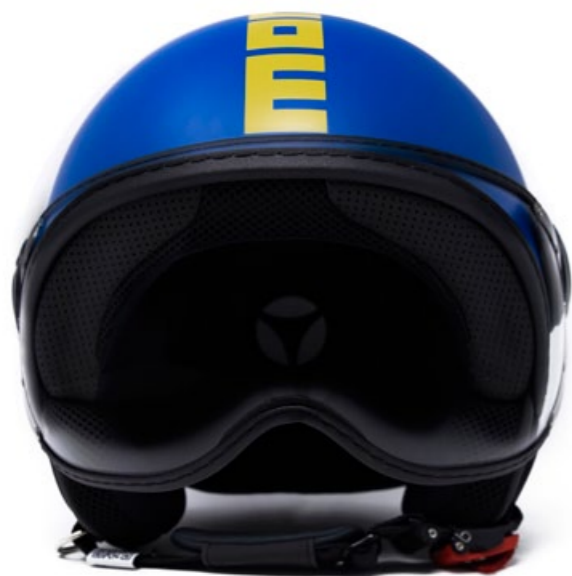
HERITAGE ALPINE BLU MATT 1001008003