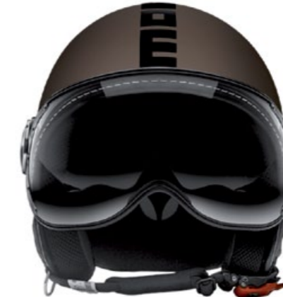
EVO TOBACCO FROST - BLACK DECAL 1001003030