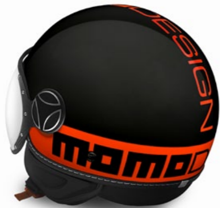
BLACK MATT - RED FLUO DECAL 1001004031