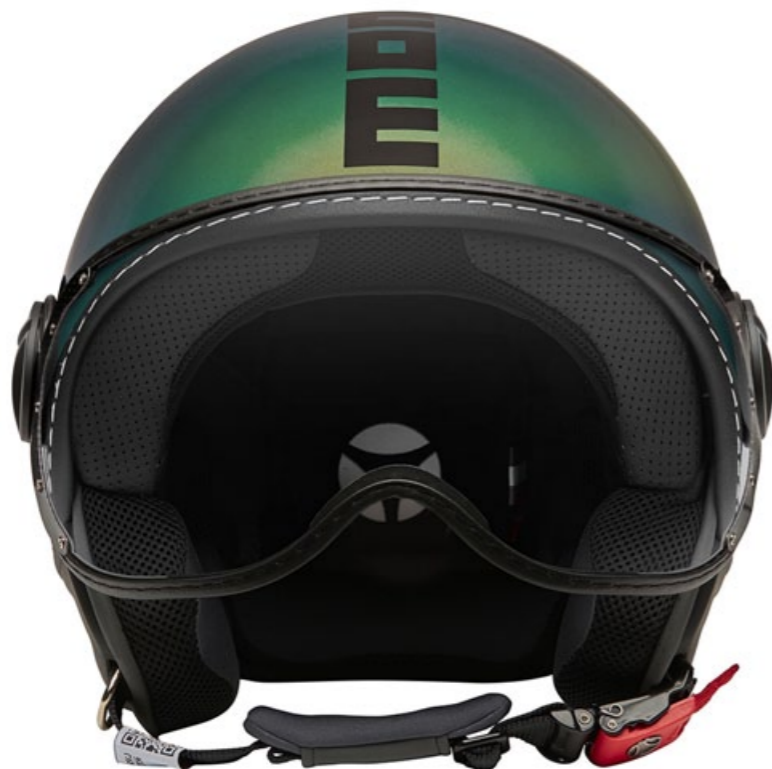
GREEN GLOSSY BLUE - BLACK DECAL 1001002042

This new FGTR edition proposes unexpected iridescent colours, a new varnish which conjures light into changeable Pop hues for a magical effect and a new style vision, Pop is perfect for those who love to dare, be alternative and extravagant. Tones to complement a fashionable Urban rider outfit. Anti-scratch visor UV400 with carbon fiber support; ABS demi jet shell in two sizes; Brushed metal screw; Inner padding with high sweat absorption fabric and mesh fabric net with silver ion treatment for an effective bacteria-static action. Chinstrap with micrometric buckle