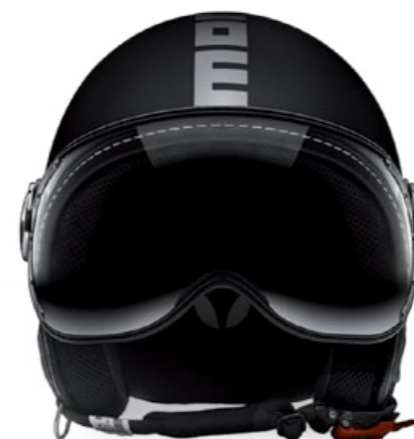
CLS BLACK MATT - SILVER DECAL 1001002002