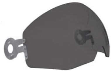
AVIO FROM 2016 DARK VISOR 80% SCRATCH RESISTANT