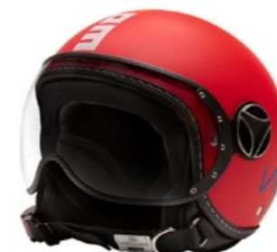
demi-jet with mid visor ABS