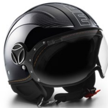
GLOSSY BLACK CARBON - SILVER OUTLINE DECAL 1003009000 PRICE: €309,00

small shell - XXS 54cm - XS 55cm S 56cm - M 57cm large shell - ML 58-59cm - L 60cm XL 61cm