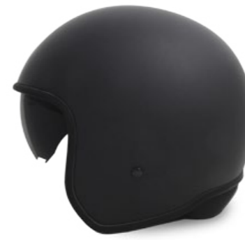
long-jet with sun visor composite fiber