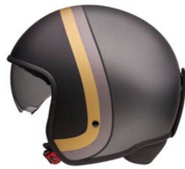
long-jet with sun visor composite fiber