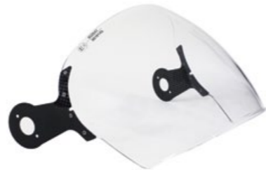
LONG VISOR CLEAR RESISTANT