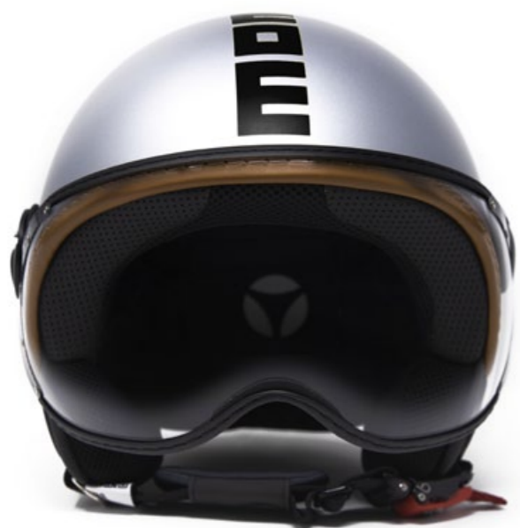
HERITAGE ALLUMINIUM GREY 1001008000