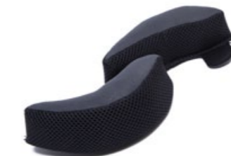
CHEEK PADS (PAIR) EAGLE BLACK XXS-L