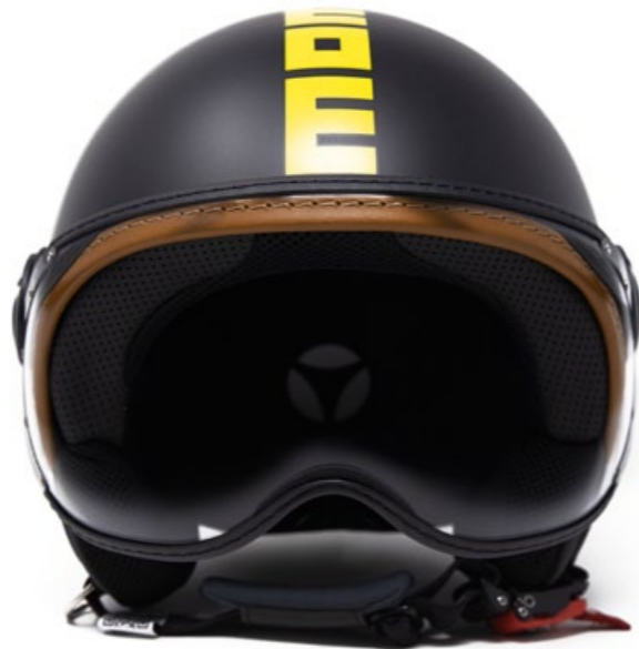
HERITAGE BLACK MATT 1001008001