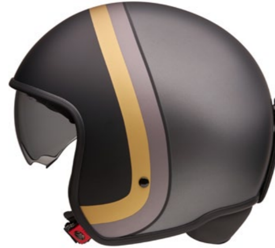
VINTAGE ANTHRACITE - GOLD/GREY/BLACK 1014053001