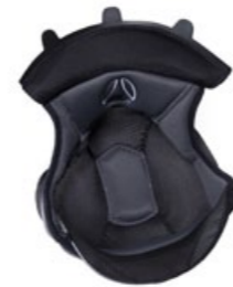
INNER PADDING SIZE EAGLE XXS-XL