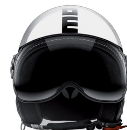
CLS WHITE GLOSSY - BLACK DECAL 1001002006