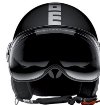
EVO BLACK MATT - WHITE DECAL 1001003003