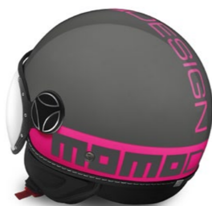
GLOSSY GREY - FUXIA FLUO DECAL Only women size XXS-M 1001004028