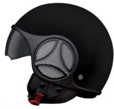
demi-jet with sun visor ABS