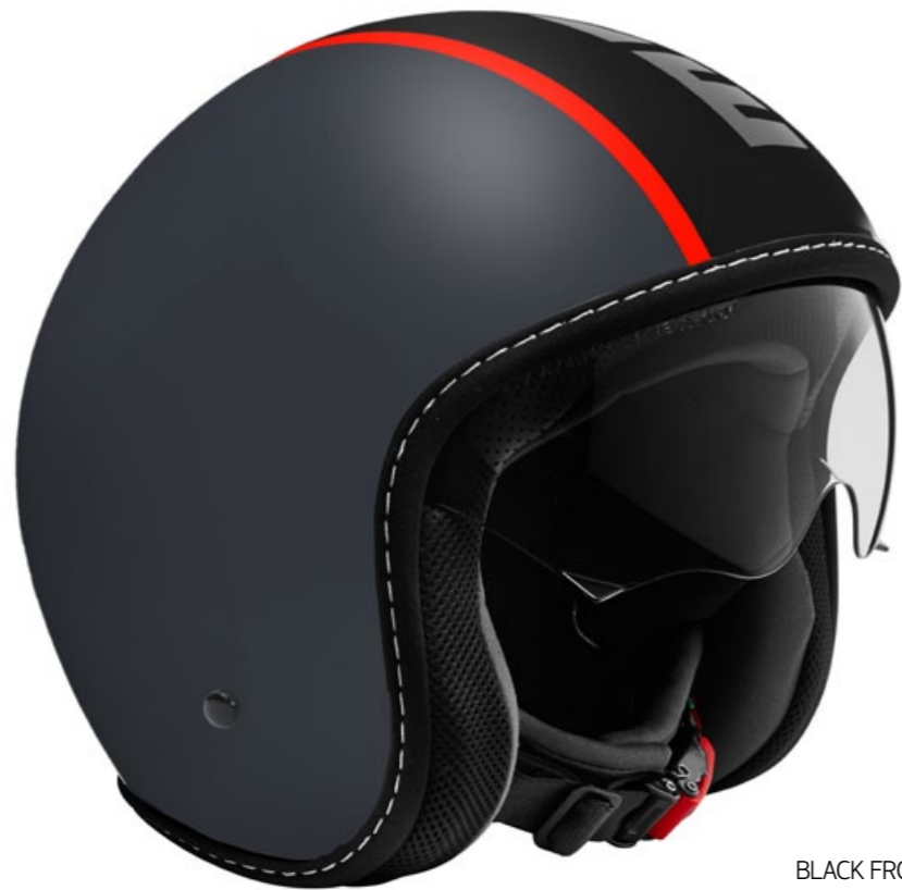
BLACK FROST - BLACK DECAL 1011002002