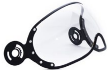
FGTR BABY CLEAR VISOR