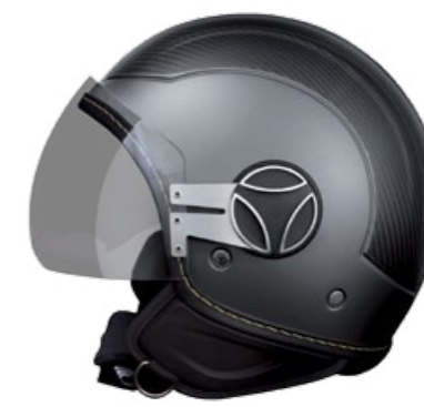
demi-jet with mid visor composite fiber