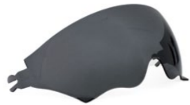
SUN VISOR EVO FUME' 50% DARK