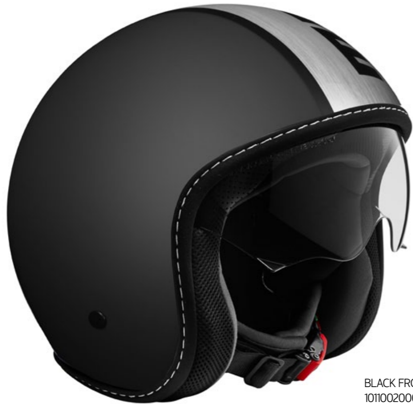
BLACK FROST SATIN - BLACK DECAL 1011002000

BLADE is a Jet with a shell of contained dimension with a linear and shiny central graphic characterized by the logo. Blade is designed for the urban riders who are very attentive to fashion and trends and seek high-energy style and color, without sacrificing quality and safety. Inner padding with high sweat absorption fabric and mesh fabric net. ABS full jet shell in two sizes. Real stitching with technical border, removable and washable inner padding. Chinstrap with micrometric buckle, dark sun visor.