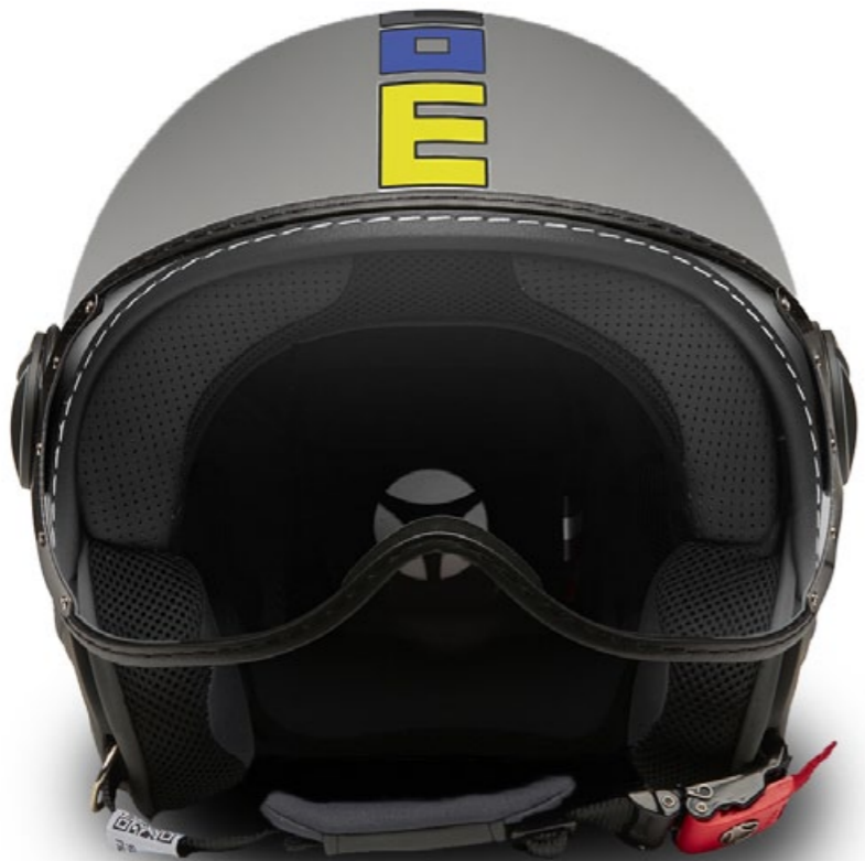
CLS GREY MATT - MLTC DECAL 1001002040