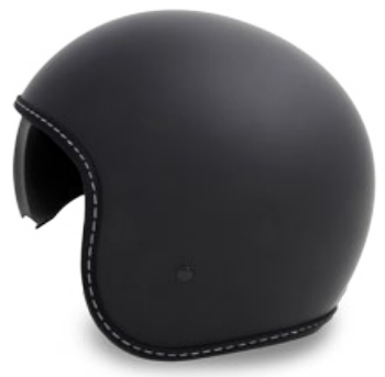
long-jet with sun visor ABS