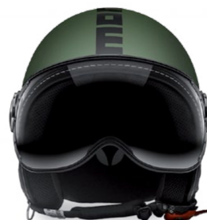
CLS MILITARY GREEN MATT - BLACK DECAL 1001002026