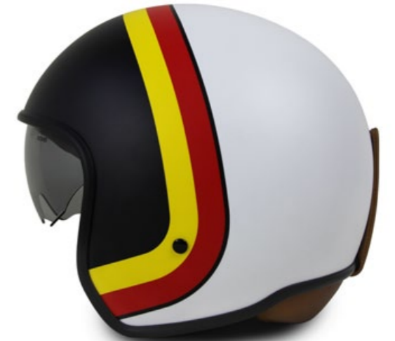
VINTAGE WHITE - YELLOW/RED/BLACK 1014053000