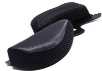
FGTR BABY CHEEK PADS