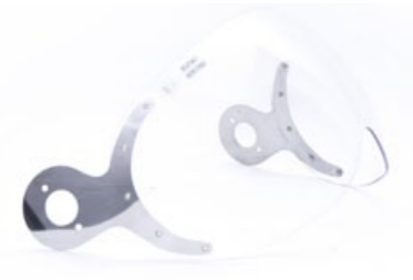
CLEAR VISOR SCRATCH RESISTANT GRAPHENE