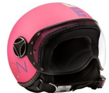
PINK MATT/MLTC 1023000002