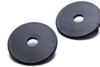
FGTR BABY VISOR MECHANISM