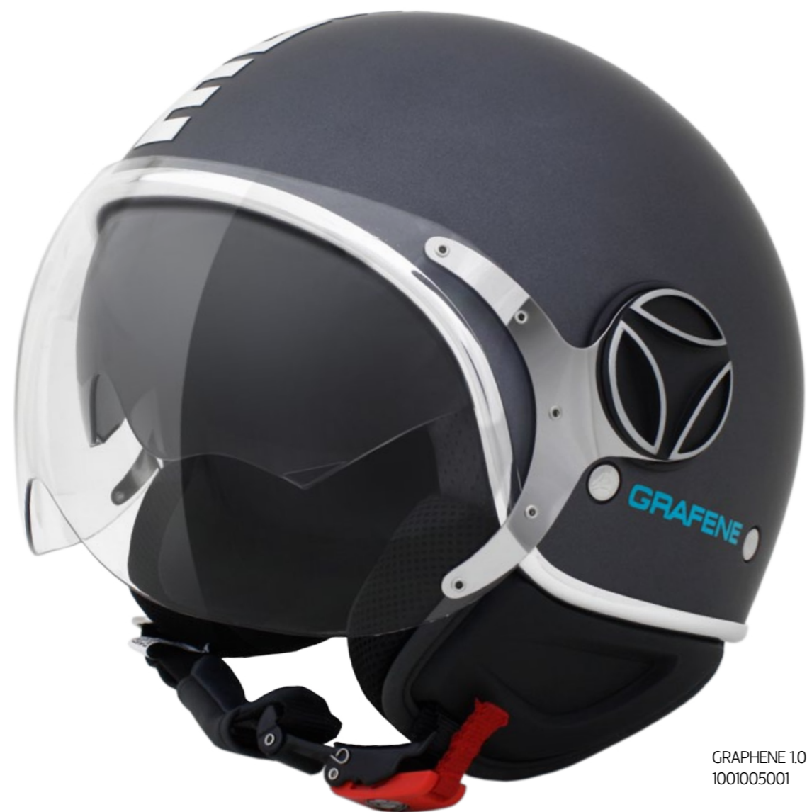
GRAPHENE 1.0 2019 1001005001