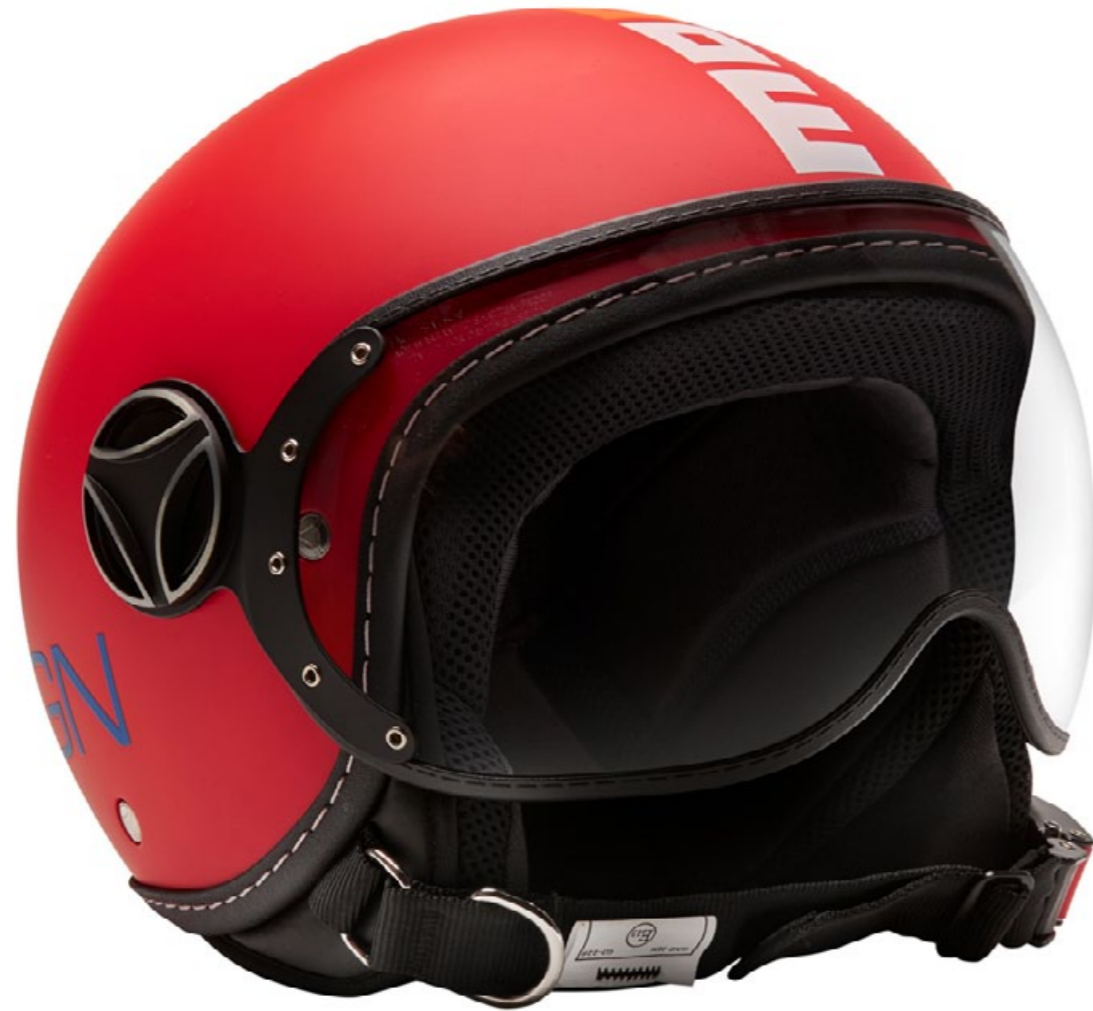
RED MATT - MLTC DECAL 1023000003

FGTR BABY is the demi-jet dedicated to the baby customers. It is inspired by iconic FGTR model shapes and style, being one generation distance between the two. FGTR BABY is the must-have helmet for all the baby riders. The fil rouge with the adult model are the extreme personalized T logo, the visor and the steel visor screws that recall the historic logo. Details that enrich aesthetic features without turning down safety. ABS demi jet shell. Metal screw, Inner padding with high sweat absorption fabric and mesh fabric net with silver ion treatment for an effective bacteria-static action.