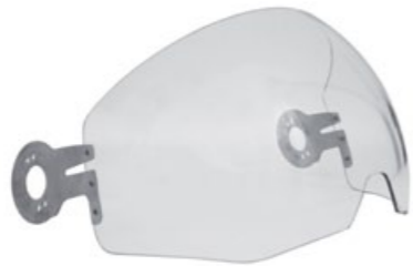
AVIO FROM 2016 CLEAR VISOR SCRATCH RESISTANT