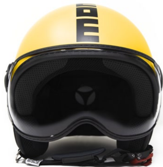
HERITAGE YELLOW MATT 1001008002