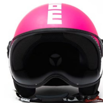
CLS METAL FUCSIA - WHITE DECAL Only women size XXS-M 1001002044