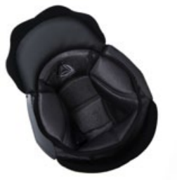
INNER PADDING SIZE FGTR BABY XS-L