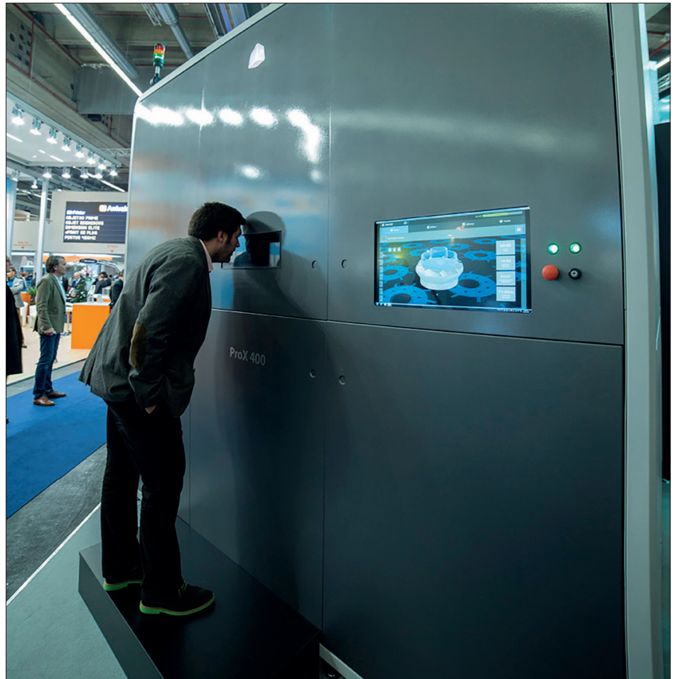
3D Systems' ProX 400 is capable of printing in more than a dozen alloys, including stainless steel, aluminum, cobalt chrome, titanium, and maraging steel.

It would be hard to estimate the comparable sales for the market for subtractive manufacturing, but Modern Machine Shop ( mmsonline.com/articles/american-manufacturing-on-the-rise ) reports that “machine tool sales should rise to $7.442 billion in 2014, an increase of 19 percent over 2013.” But wait — that only includes the sales of machine tools. The AM products and services sales