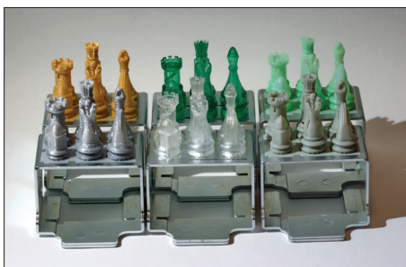
Six materials for 3D printing. New material choices are contributing to the growth of additive manufacturing.

Checking the size and shape of those internal cavities frustrates legacy QC methods so a new generation of metrology is needed. Another QC conundrum is process control. Less is known about how varia-