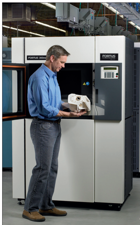
With a 3D printer you can prototype a design and hold the results in your hand in just days.

Finally, the rate at which parts are produced today using AM methods is pitifully slow. Creation of solid volumes by 3D printers is very inefficient — like coloring in large areas of an outline with a crayon over and over. This fact eliminates the use of 3D printing in many high-volume in-