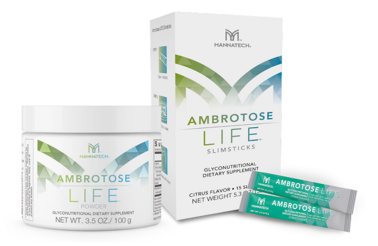
For brain health: Ambrotose LIFE® citrus-flavored slimsticks or unflavored canister

The following Mannatech supplements combine well with Omega-3 with Vitamin D<sub>3</sub>: