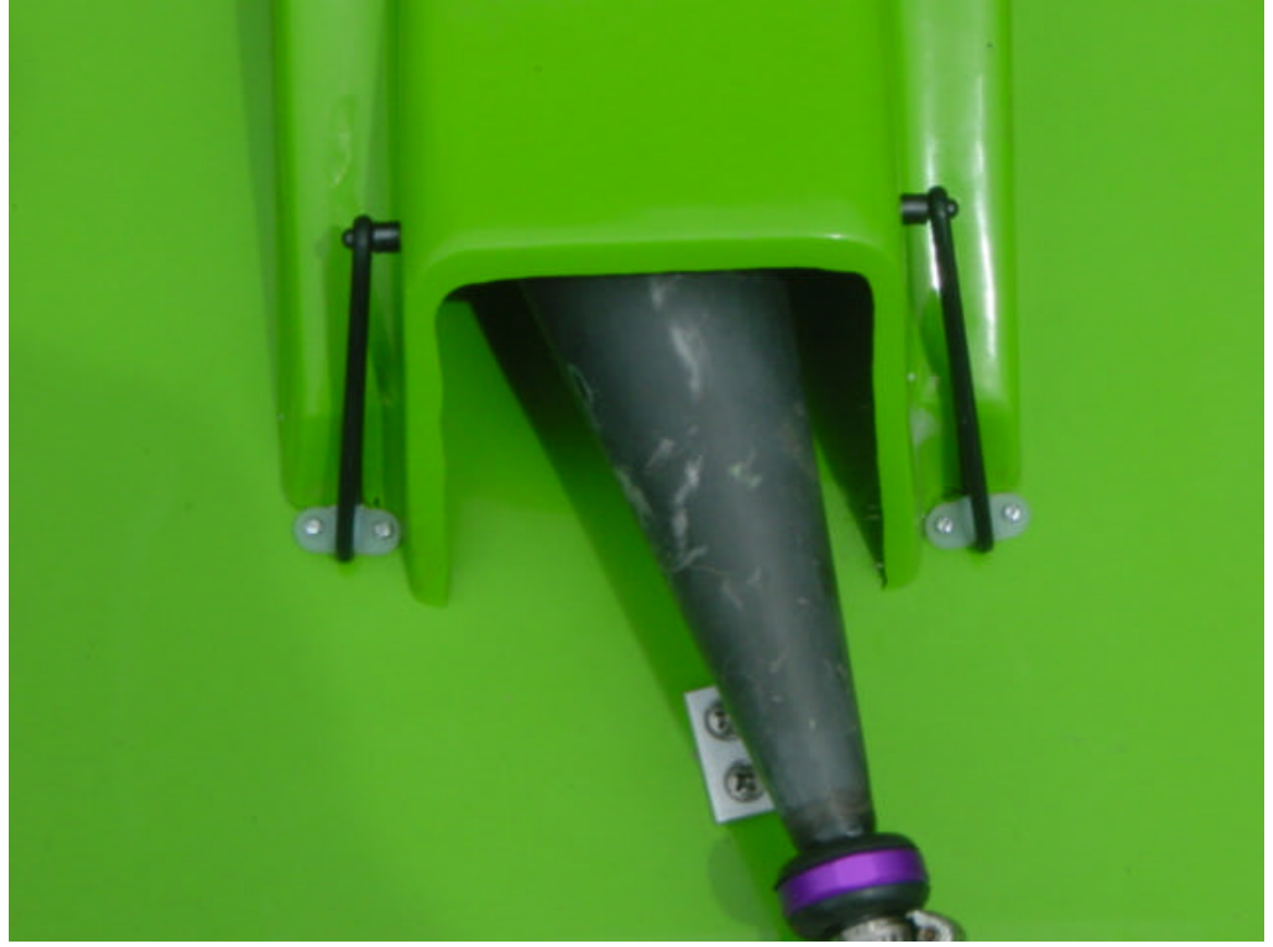
Cowl Hold Down.