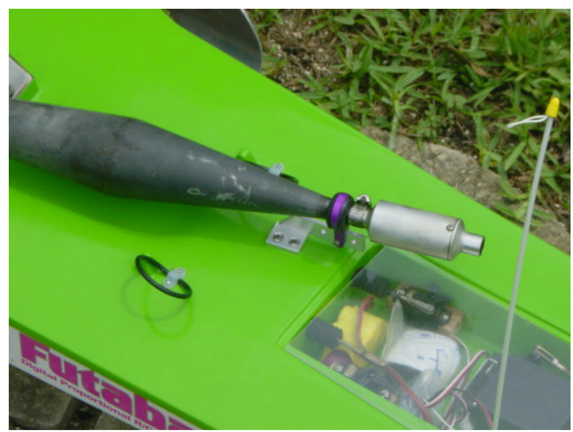
Pipe mount area.