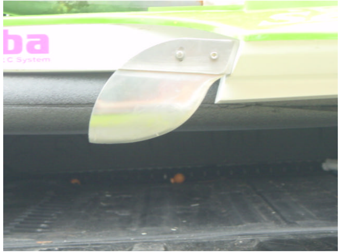
Turn Fin angle ( Roll Even with bottom of center section)