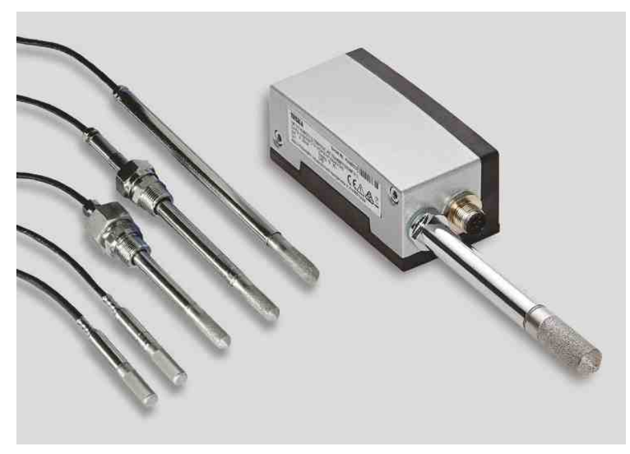
The Vaisala HUMICAP® Humidity and Temperature Transmitter HMT310 models (from left to right): HMT313, HMT317, HMT314, HMT318, HMT315 and HMT311.