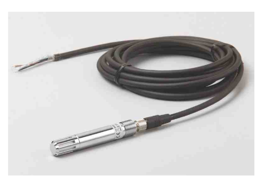
The HMP60 for extreme conditions.