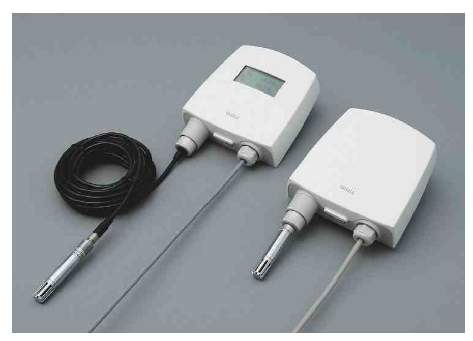
The HMT120/130 with and without a display.

The Vaisala HUMICAP® Humidity and Temperature Transmitters HMT120 and HMT130 are designed for humidity and temperature monitoring in cleanrooms and are also suitable for demanding HVAC and light industrial applications.