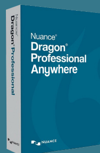
Dragon Professional Anywhere