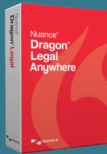
Dragon Legal Anywhere

For all queries, please call on 0121 456 7800