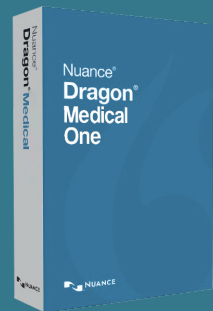
Dragon Medical One