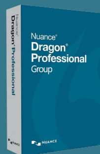
Dragon Pro Group