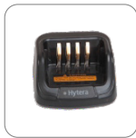
MUC Rapid-rate Charger