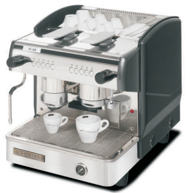
Compact 2 Group Capsule