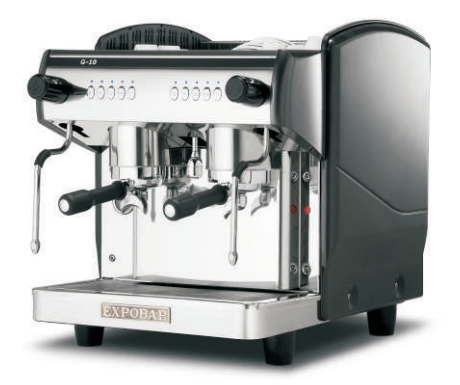
Compact 2 Group