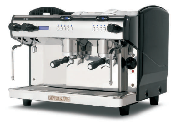
2 Group Multi Boiler