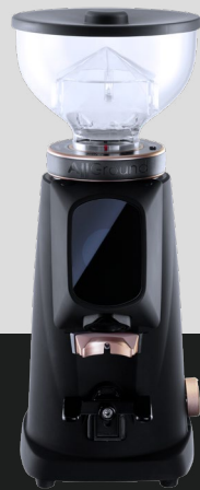
Deep Black & Rose Gold