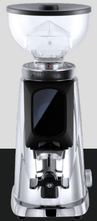
Chrome Plated & Deep Black