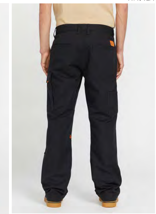
CALIPER RELAXED WORK PANT