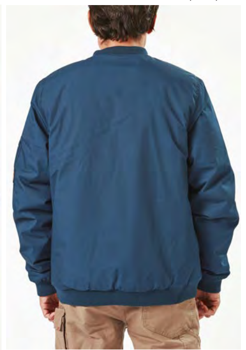
A1702000 VOLCOM WORKWEAR JACKET