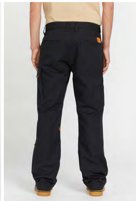
A1142301 CALIPER RELAXED WORK PANT BLK - BLACK