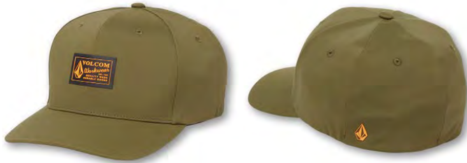
D5502200 VOLCOM WORKWEAR HAT OLV - OLIVE S/M | L/XL