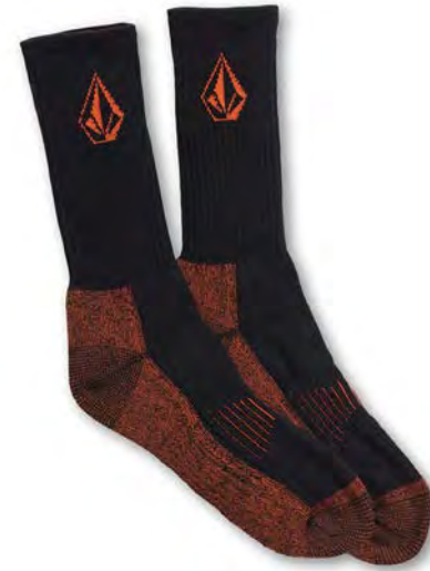
D6302006 VOLCOM WORKWEAR SOCK 3PK BLK - BLACK O/S