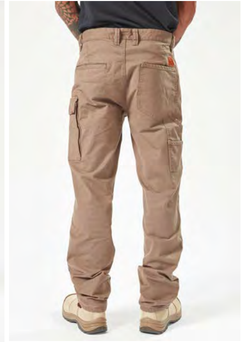
A1102002 CALIPER WORK PANT BNL - BRINDLE