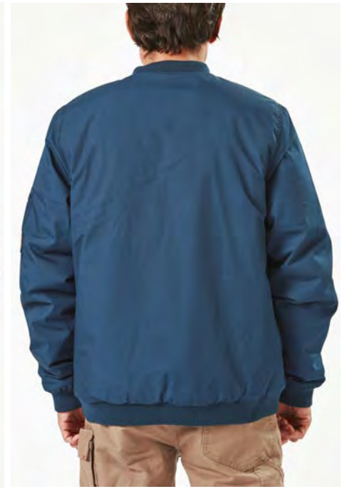
A1702000 VOLCOM WORKWEAR JACKET NAVY - NAVY S | M | L | XL | XXL