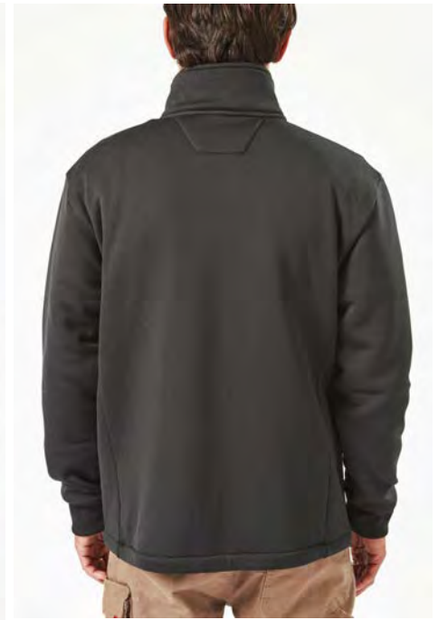
A5802201 VOLCOM WORKWEAR BONDED FLEECE BLK - BLACK