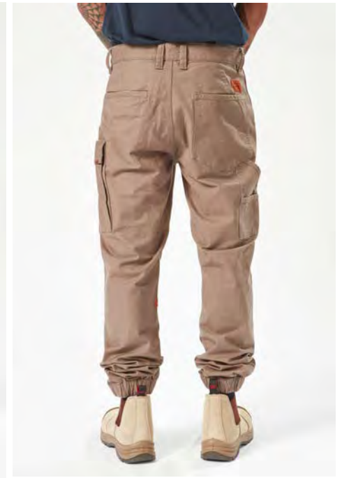
A1102003 CALIPER CUFF PANT BNL - BRINDLE