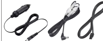
CP-25H OPC-515L OPC-656 For use with For use with For use with BC-210 BC-210 BC-197