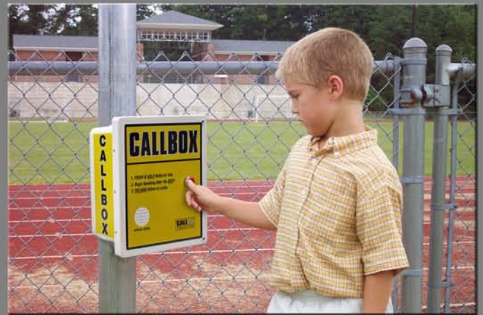
CALL24 Models: MAU-DMR, MAV-DMR, MA8-DMR, MA9-DMR

GATE or LOCK RELEASE: CALL24's Need to remotely open an entrance gate or release an electronic lock? The M-Series radio callbox switch release option provides remote access control to service providers or employees needing access to restricted areas. Why walk all the way to a gate when you can open it remotely using an employee's portable control radio?