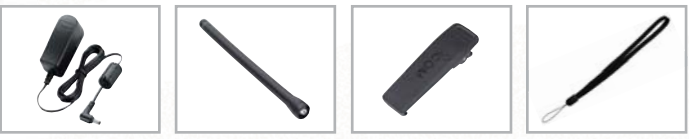
BC-123S* AC adapter FA-SC58V antenna MBB-3 belt clip Hand strap