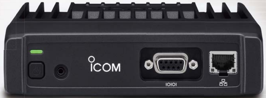
RS-232 + Ethernet Version