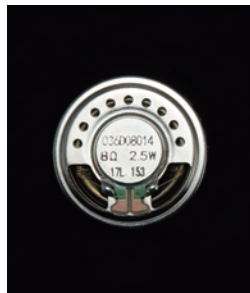
Icom custom high power handling capacity speaker