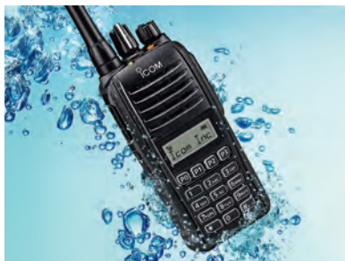
Waterproof for 30 minutes in one meter depth of water