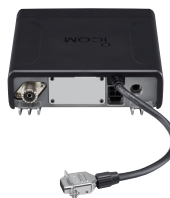
Optional OPC-1939 installation image