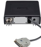
Optional OPC-2078 installation image