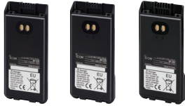
BP-278 BP-279 BP-280

BP-278: 1190 mAh (typ.), 1130 mAh (min.) rechargeable Li-ion battery. BP-279: 1570 mAh (typ.), 1485 mAh (min.) rechargeable Li-ion battery. BP-280: 2400 mAh (typ.), 2280 mAh (min.) rechargeable Li-ion battery.