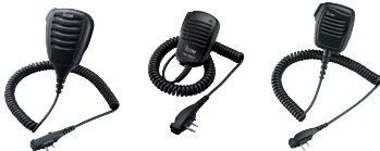
HM-168LWP HM-158LA HM-159LA

HM-168LWP: Waterproof speaker microphone with a waterproof connector. IP67 protection. HM-158LA: Compact speaker microphone with 3.5 mm earphone jack. HM-159LA: Speaker microphone with 3.5 mm earphone jack.