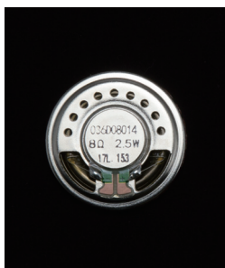
Icom custom high power handling capacity speaker