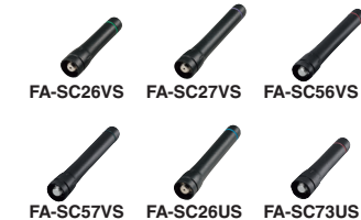
FA-SC57VS FA-SC26US FA-SC73US

FA-SC26VS: 136–144 MHz FA-SC27VS: 142–150 MHz FA-SC56VS: 150–162 MHz FA-SC57VS: 160–174 MHz FA-SC26US: 400–450 MHz FA-SC73US: 450–490 MHz