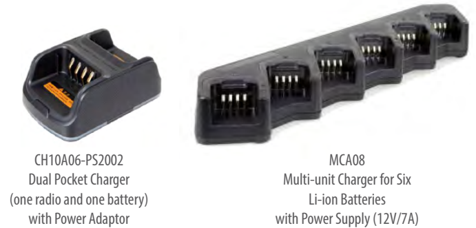
CH10A06-PS2002 Dual Pocket Charger (one radio and one battery) with Power Adaptor