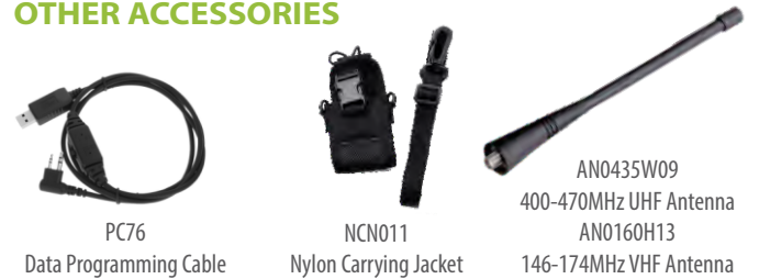
PC76 Data Programming Cable