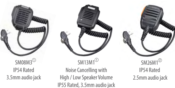
SM08M3 ① IP54 Rated 3.5mm audio jack

Remote Speaker Mics provide easy access for audio, are IP rated for water resistance, and have audio jacks for receive only earpieces.