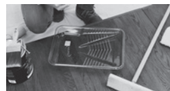
APPLY WITH A GOOD QUALITY BRUSH OR PAD APPLICATOR OR BY SPRAYING