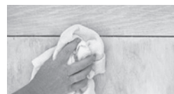
APPLY WITH RAG, GOOD QUALITY BRUSH OR PAD APPLICATOR