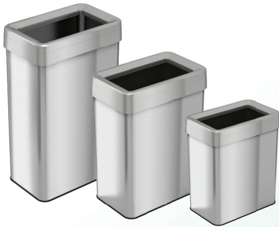
Stainless Steel Open Top Bins with Deodorizers (HLS21UOT / HLS18UOT / HLS16UOT)

Introducing a new line of decorative open top receptacles. These stainless steel bins are perfect for multi-family residential, healthcare, hospitality, and other high-traffic venues.