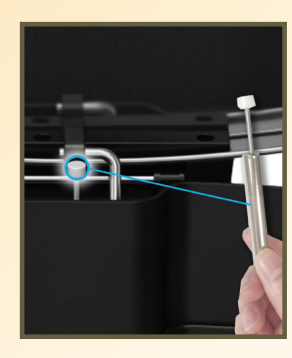
Replaceable Air Damper