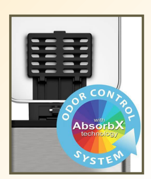
AbsorbX® Replaceable Odor Filter