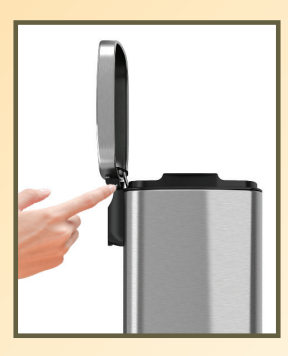
Lid Stay-Open Mode