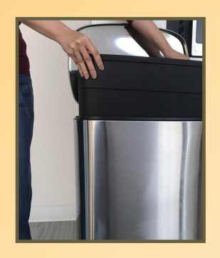
Removable Inner Bucket