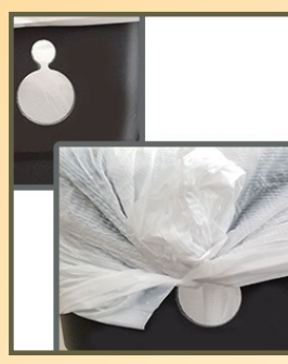
Tuck & Hold Bag Retention