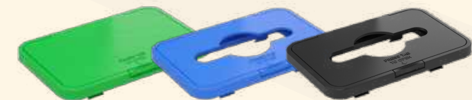
Lid Attachment for 16, 18, 21 Gallon Rectangular Open Top Bin compatible with HLS16UOT / HLS18UOT / HLS21UOT (LIDROCOP / LIDROREC / LIDROTRS)