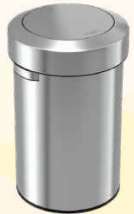
17 Gallon Stainless Steel Round Swing Top (HLS17FTS) 17 G / 64 L 16" L x 16" W x 25.5" H