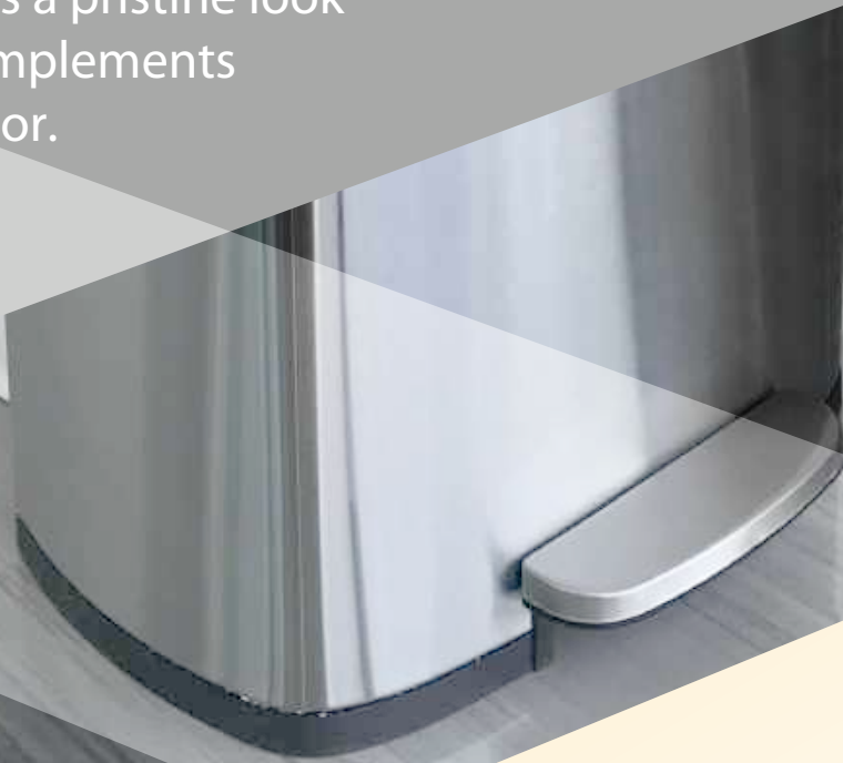
3 Gallon Slim Step Pedal with Plastic Liner (HLSS03R) 3 G / 10 L 13.5" L x 6.5" W x 15.5" H

Our step on bins feature durable yet easy to use pedals and gentle, silent lid closures. Premium quality stainless steel provides a pristine look that complements any décor.