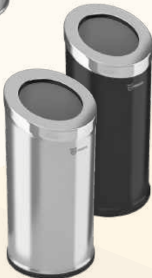
15 Gallon Round Beveled Open Top Stainless Steel and Black Powder-Coated (HLSC04G15A / HLSC04G15B) 15 G / 57 L 14.9" L x 14.9" W x 31.5" H