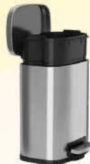
13.2 / 8 / 1.32 Step Pedal with Plastic Liner (HLSS13R / HLSS08R / HLSS01R) 13.2 G / 50 L 16.75" L x 12.5" W x 26" H 8 G / 30 L 13.7" L x 11.8" W x 25" H 1.32 G / 5 L 8.5" L x 7.3" W x 11.8" H