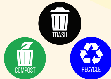
Vinyl Decals Trash / Compost / Recycle 3-Pack (HLSKERTRASH3 / HLSKERCYCLE3 / HLSKERCCOMP3)