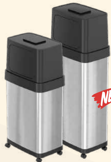
18 / 24 Gallon Stainless Steel Rectangular Dual Push Door (HLS18DPS / HLS24DPS) 18 G / 68 L 17" L x 11" W x 34.25" H 24 G / 91 L 17" L x 11" W x 42.24" H