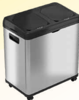
16 Gallon Stainless Steel Combo Sensor Recycle and Trash Can (HLS16DCSS) 16 G / 60.8 L 23.13" L x 13.88" W x 22" H