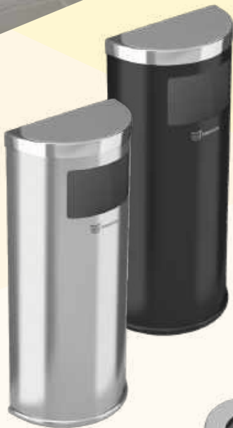
9 Gallon Half-Round Side-Entry Stainless Steel and Black Powder-Coated* (HLSC01G09A / HLSC01G09B) 9 G / 34 L 15.7" L x 7.9" W x 35.4" H *may be wall mounted