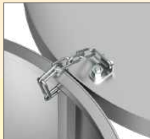
Lid Security Chain