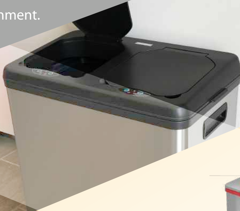
13 Gallon Stainless Steel Pedal-Sensor Black, Red, or White Trim 13 G / 50 L 16.5" L x 11.75" W x 22.25" H

HLS Commercial® sensor-activated, touchless trash bins are the convenient and hygienic way to dispose of waste. Enhanced infrared sensor technology allows for hands-free lid open and close, promoting a healthier environment.