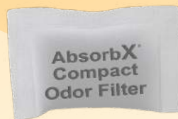
AbsorbX® Compact Odor Filter 3-Pack (HLS08CF3)

*compatible with HLS02SS / HLS04SS (HLSFGLEMON3)