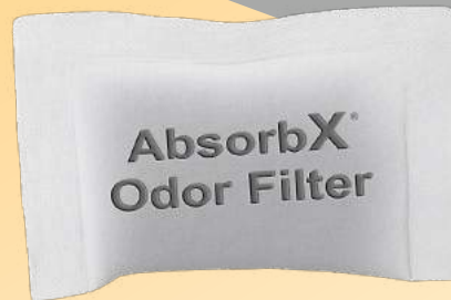
AbsorbX® Odor Filter 3-Pack (HLS12CF3)