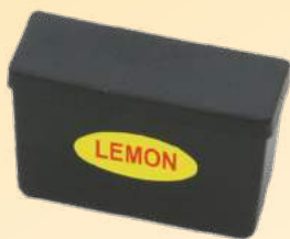
Lemon-Scented Fragrance Cartridge 3-Pack*

*compatible with HLS02SS / HLS04SS (HLSFGLEMON3)