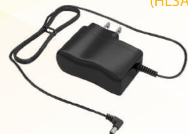
AC Adapter (HLSAC)