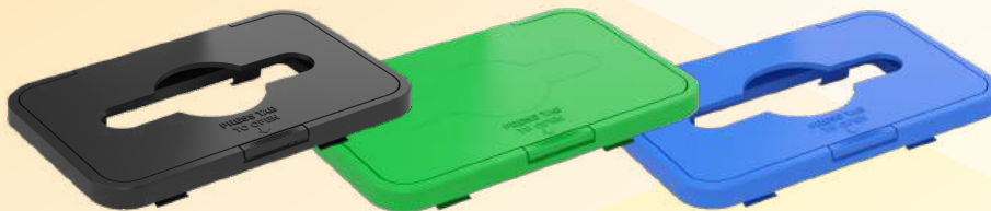
Lid Attachment for 16, 18, 21 Gallon Rectangular Open Top Bin* *compatible with HLS16UOT / HLS18UOT / HLS21UOT Trash (LIDROTRS) Compost (LIDROCOP) Recycle (LIDROREC)

3-Pack Trash (HLSKERTRASH3) 3-Pack Compost (HLSKERCCOMP3) 3-Pack Recycle (HLSKERCYCLE3)