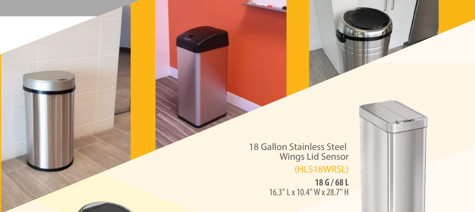
18 Gallon Stainless Steel Wings Lid Sensor (HLS18WRSL)