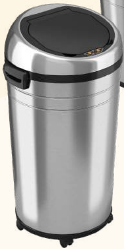
23 Gallon Stainless Steel Extra Large Round Sensor with Removable Wheels (HLS23RC)

23 G / 87 L 19.25" L x 17.5" W x 32.6" H