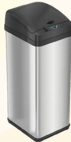
13 Gallon Stainless Steel Rectangular Sensor (HLS13MX)

23 G / 87 L 19.25" L x 17.5" W x 32.6" H