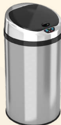
8 Gallon Stainless Steel Round Sensor (HLS08RCB)

A diverse range of size and shape options. Bins fit standard liners.