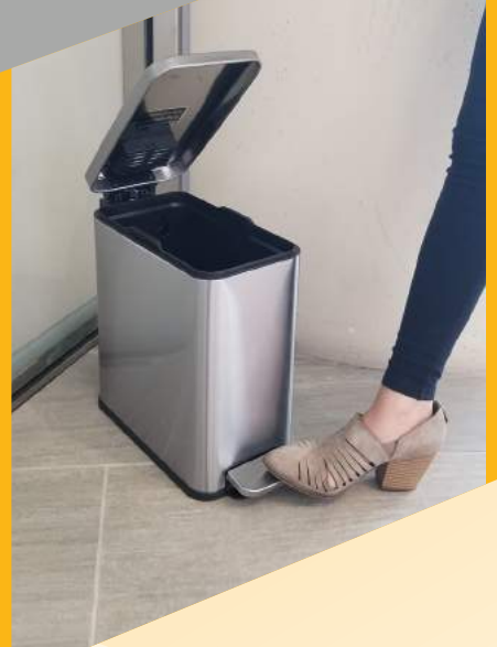
3 Gallon Slim Step Pedal with Plastic Liner (HLSS03R) 3 G / 10 L 13.5" L x 6.5" W x 15.5" H