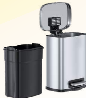
1.32 / 8 / 13.2 Gallon Step Pedal with Plastic Liner