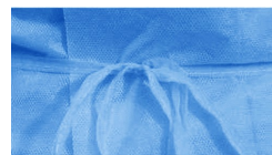
Tie around the waist

Our all-in-one PPE Kit provides all the protection you need to practice safely and efficiently.