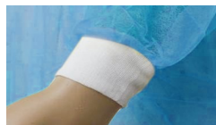
Long sleeve, knitted cuffs