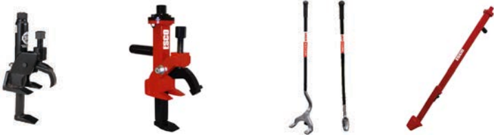
Manual & Pneumatic Bead Breakers • Manual Tire Demounting Tools