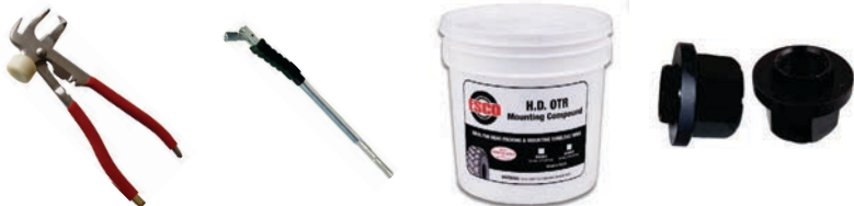
Wheel Weight Hammers • Valve Stem Pullers • Tire Lube • Wheel Attaching Parts