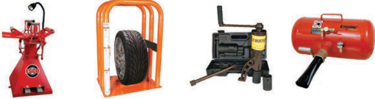
Tire Spreaders • Tire Inflation Cages • Torque Tools • Tire Inflators