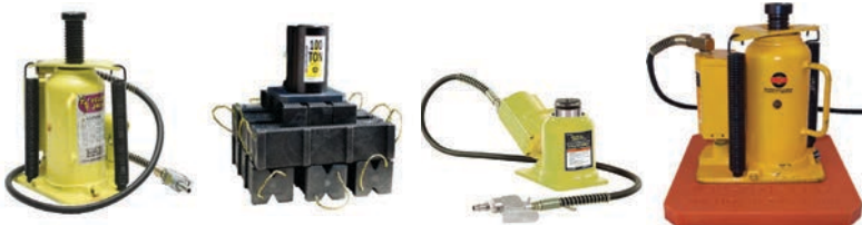
Air Hydraulic Bottle Jacks • Cribbing • Jack Support Plates