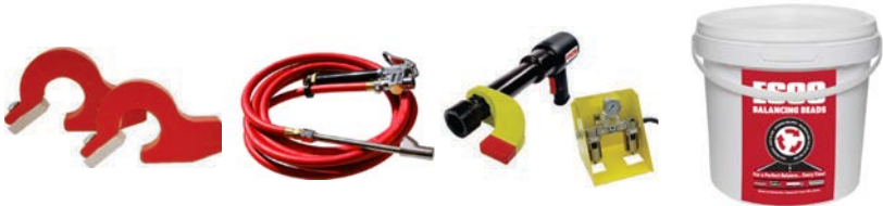
Bead Holders • Air Inflation Hoses • Pneumatic Torque • Balancing Beads