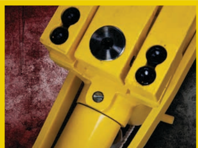
NEW DESIGN sequence valve