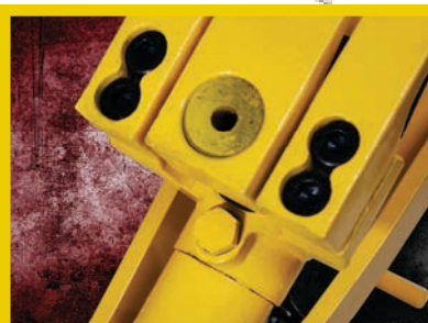
OLD DESIGN sequence valve