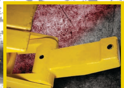
NEW DESIGN jaw locking pin