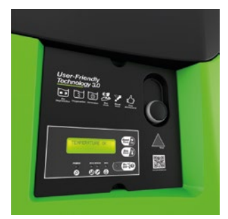
CONTROLS > Digital screen with Boost mode and Eco mode, tool-free interchangeable control unit.