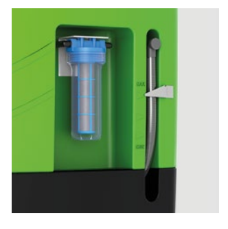
EASY MAINTENANCE > Drain tap, reusable 100 µm cartridge filter.