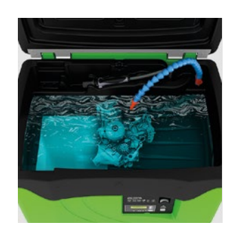
CLEANING AND SOAKING SINK > Retractable brush and flex spigot, large sink for soaking parts for tough cleaning.