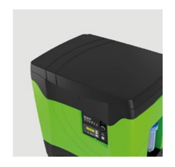
HERMETIC LID > Limits evaporation of the solution.