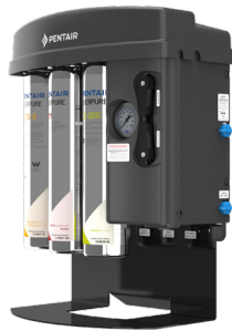
EZ-RO 200/16G with optional floor stand bracket