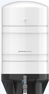
16-gallon hydropneumatic tank