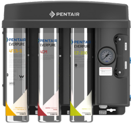
EZ-RO 200/16G wall mount