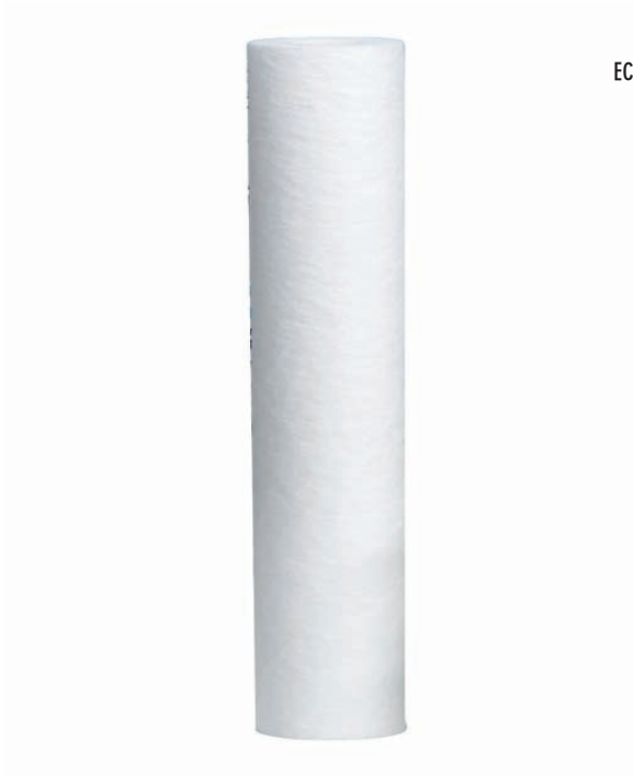
EC110 Prefilter Cartridge: EV9534-12