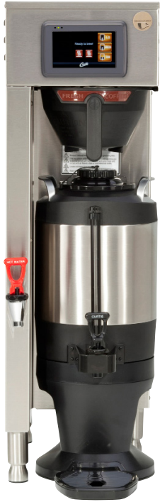
G4TP2S63A3100 SINGLE COFFEE BREWER WITH ONE 1.5 GALLON TXSG1501S600 DISPENSER