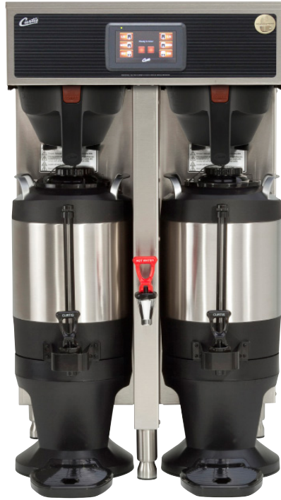
G4TP2T10A3100 TWIN COFFEE BREWER WITH TWO 1.5 GALLON TXSG1501S600 DISPENSERS