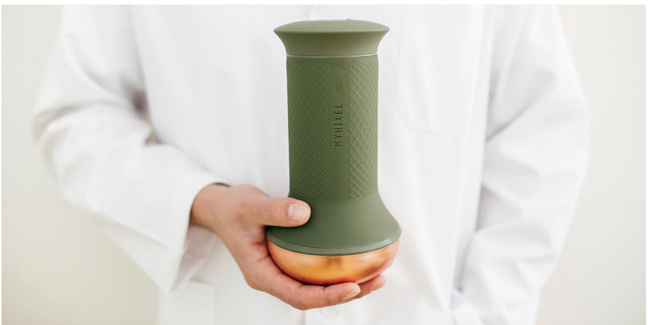
Doctor with a MYHIXEL I device

In fact, our last study published at Plos One journal is about the efficacy of Sphincter Control Training and medical device in the treatment of premature ejaculation .