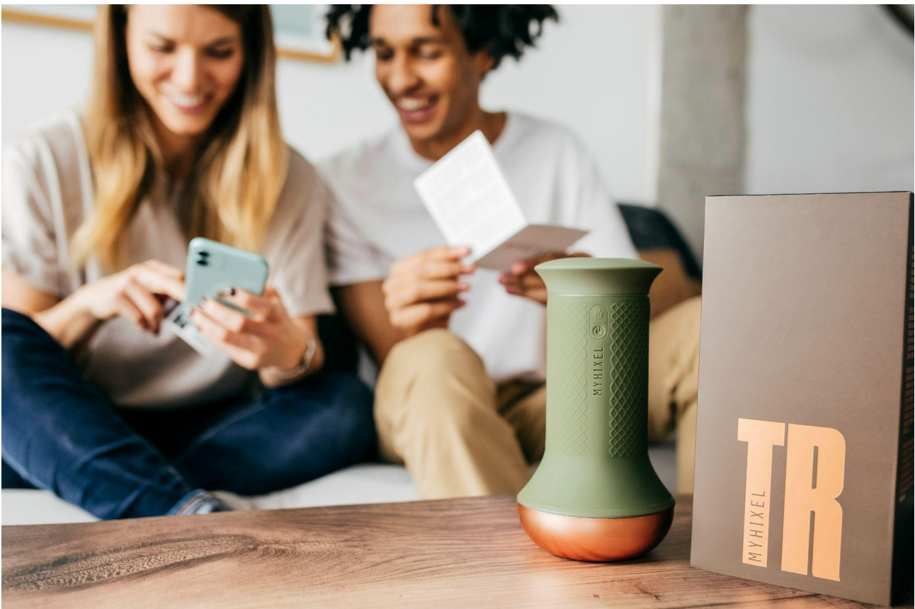
Couple unboxing MYHIXEL TR solution, and configuring the program

innovation, winning awards such as ' Best New Company 2020 ' at the Sign Magazine Awards, ' Second best startup project ' at Pitch at the Beach (the most significant investment event in Latin America), and the Xbiz Award for our innovative role in the industry where we won Best Device and Best Intimate Brand , in addition to other awards and nominations in major events.