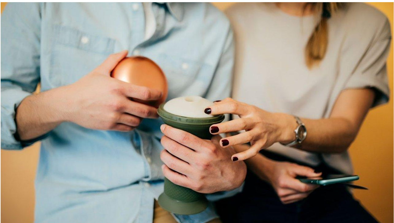
MYHIXEL Play app and the MYHIXEL I device.

We also offer products and services for men to meet their needs and to bring their sex-life to the next level .