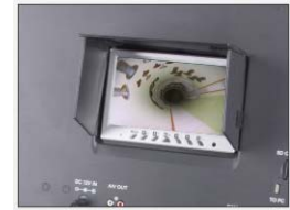
7" TFT LCD