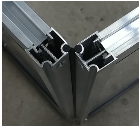
Set-up is complete and ready to use.