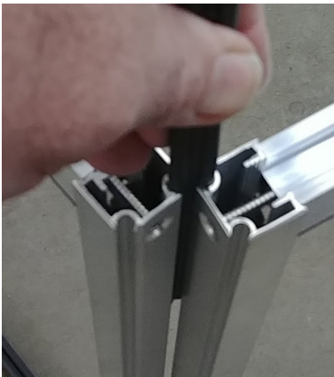
Make sure the hinge is flush