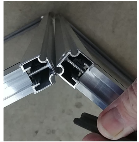
Slide the hinge into both grooves simultaneously