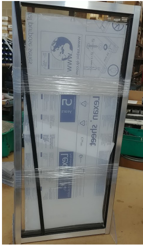
Stand PanelGuards upright