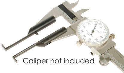
Caliper not included

A complete range of accessory jaws that fit on most 6" Calipers for measuring grooves. Finds many uses including undercuts and grooves of all types.