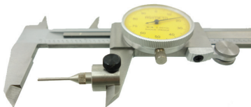
Caliper and clamp-on not included