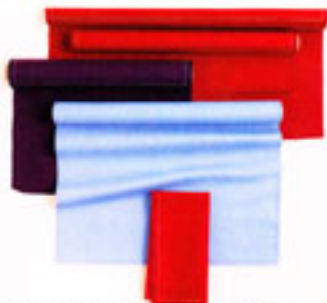
Assorted cloth napkins and placemats, regularly $25 to $34 per roll Lucky Breaks price $17.50 to $24 per roll

The five scents in this set all have an intense, moody quality that is sure to appeal to the tweedy academic in your life. A special shout-out to the intoxicating Orange Sanguine, which smells exactly like a sunlit terrace in Marbella (we'd imagine). GO TO ATELIERCOLOGNE.COM AND ENTER "LUCKYBREAKS9" TO SAVE 15 PERCENT ON EVERYTHING.