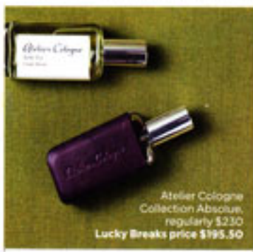
Atelier Cologne Collection Absolu, regularly $230 Lucky Breaks price $195.50