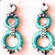
Earrings, regularly $190 Lucky Breaks price $133

This cute breakfast-and-a-blossom-in-bed tray, which kind of looks like it should be on display at MoMA, will thrill the pampered mother-in-law, the lazy boyfriend or the design-snob coworker. Also works as a (not so) subtle hint. GO TO BYWHITE.COM AND ENTER "LUCKYBREAKS3" TO SAVE 35 PERCENT.