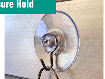
Easy to use, simply press firmly against smooth surface for a secure hold. Can be removed and reattached.