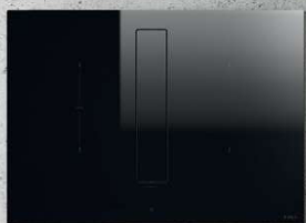
NIKOLATESLA FIT 70