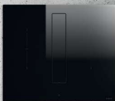
NIKOLATESLA FIT 60