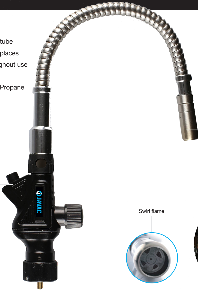
Trigger start ignition