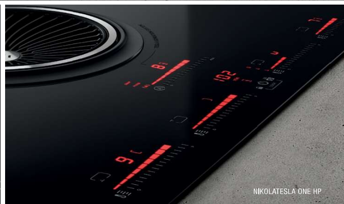
NIKOLATESLA ONE HP