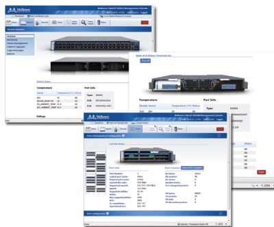
Figure 1. Sample Screenshots †

The move to modern datacenters is driving new and dynamic operation models. Onyx provides operators with a wide range of tools to address these needs, including enhanced parsing, dynamic pipeline control, and enhanced OpenFlow implementation to enable numerous SDN deployment models. In addition, Onyx supports Docker containers, which enable software to be run in isolation, full SDK access, faster and secure delivery of customized applications, and more.