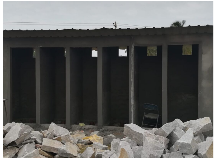
Bio-toilets under construction