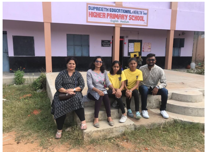
Inaugurated sewa toilet units (left), Sewa team with Sewa Volunteers at Supreet hippo campus, Mysore - Karnataka (right)