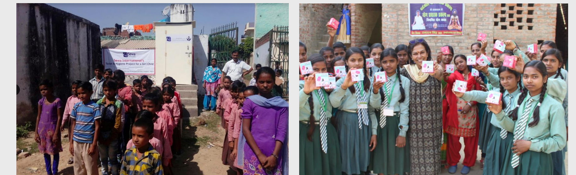
Figure 2: Installed Bio-toilet at Agra, Uttar Pradesh (left), Menstrual cups distribution at Varanasi, Uttar Pradesh