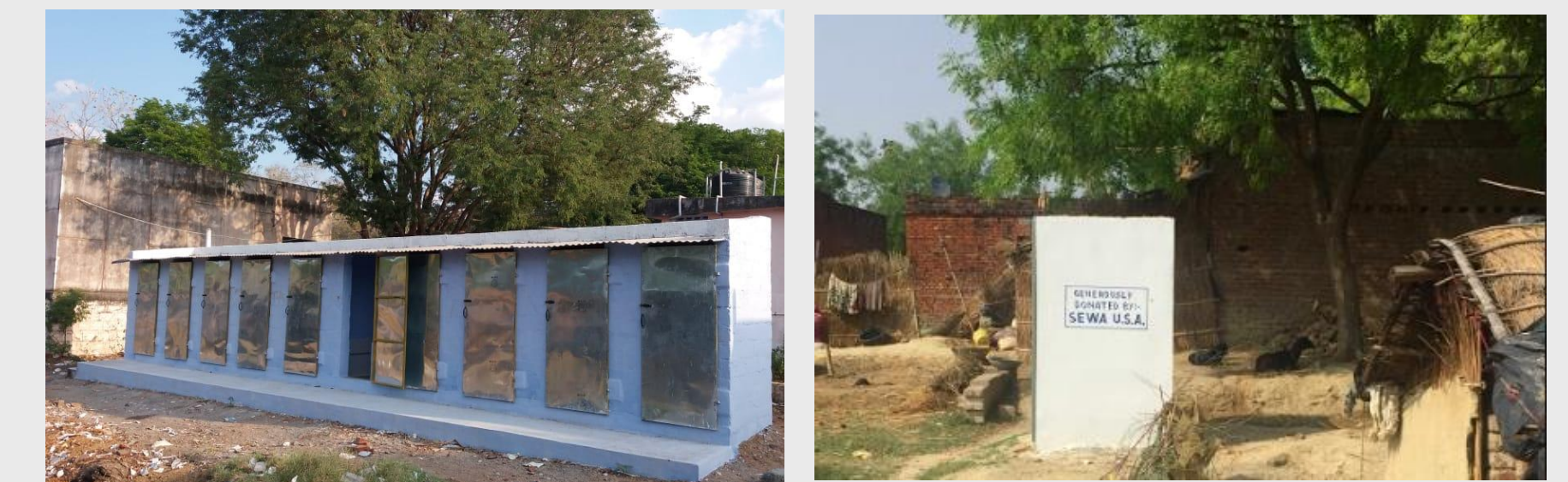
Figure 1: Inauguration of Bio-toilets at Dindigul, Tamil Nadu (left), Installed Bio-toilet at Mirzapur, Uttar Pradesh (right)