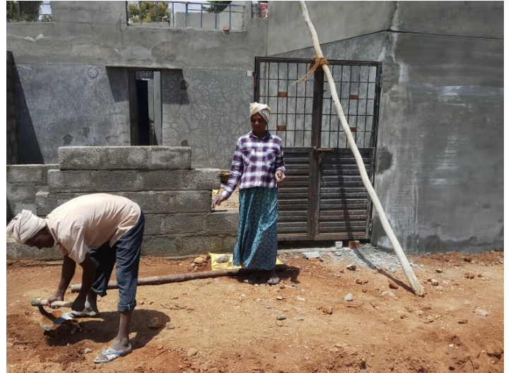
Bio-toilets under construction