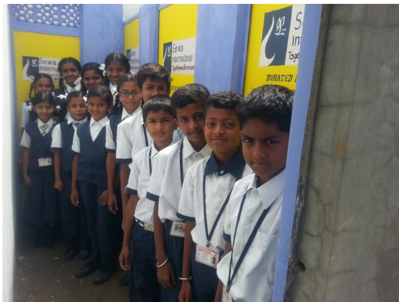
Inaugurated sewa toilet units