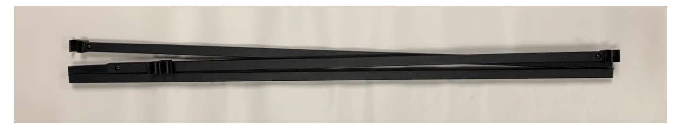
Gun Holders (3)

The below components are NOT needed for initial assembly. Set them aside for now. Crossbar (1)