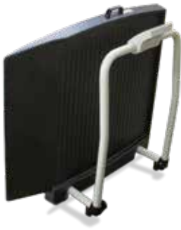
Wheelchair scale in folded position