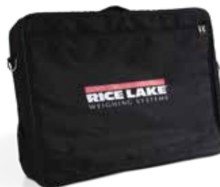
Optional Transport/Carrying Case